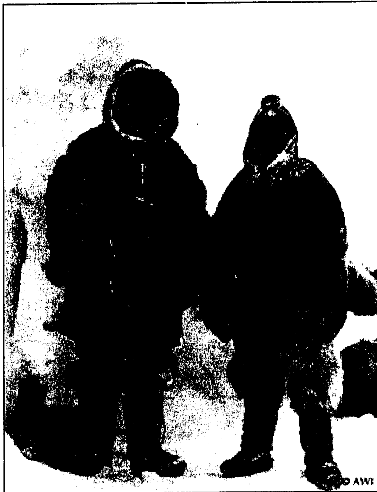
The last photo of Alfred Wegener and Rasmus Villumsen, taken on 1 November 1930